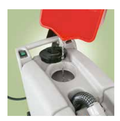
The 20 litre capacity of the solution tank ensures very long operating autonomy thanks to the usual low consumption rate of foam systems

buses or between the rows of seats in cinemas or in conference rooms of hotels.