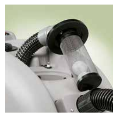
The recovery tank is provided with the effective AIR STOP filter which gets rid of even the tiniest residues of foam flakes so that the integrity of the suction motor is preserved