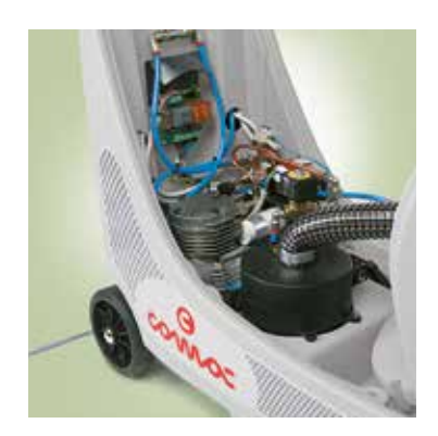
The internal compressor ensures optimal foam formation. The two-stage suction motor removes rapidly and thoroughly the product from the fabric that has been treated