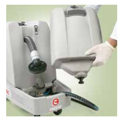
Tank emptying can also be performed by removing the tank to empty it in a proper location or directly on site by removing the plug which is under the frame